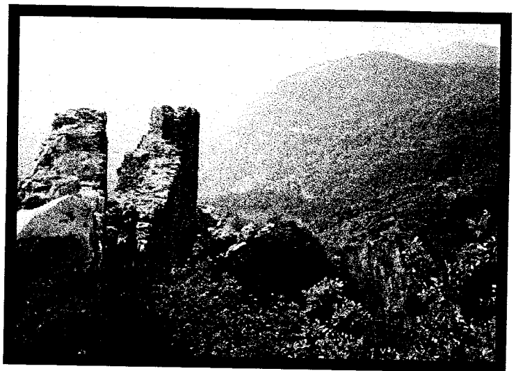
View of deep chasms and mountains of Sparta from Mystra wall. Sparta, Peloponnese.