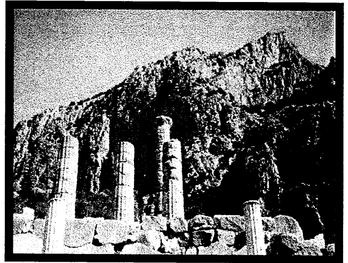
Temple of Apollo in front of the steep cliffs